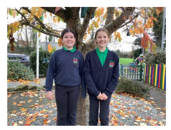
Bus Prefects 2023/24