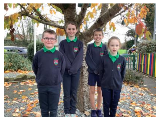
Anti-bullying Ambassadors 2023/24