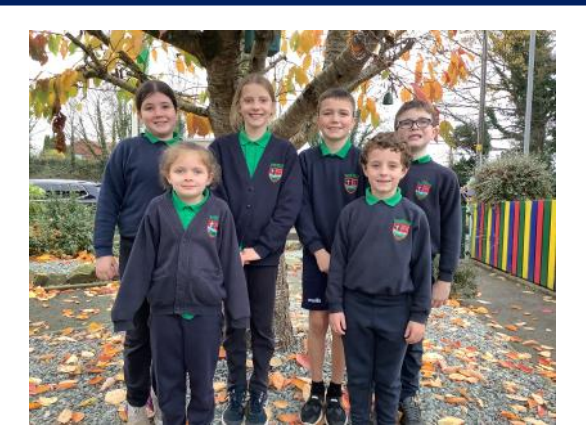
Play Leaders 2023/24