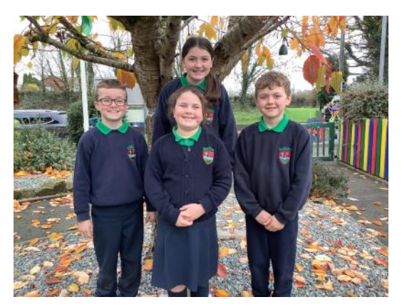
Eco Council 2023/24