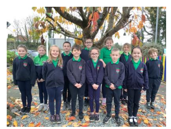
Take 5 Ambassadors 2023/24