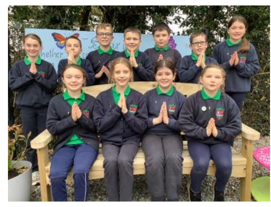
Pastoral Council 2023/24