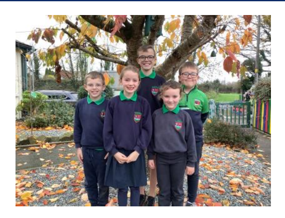
School Council 2023/24