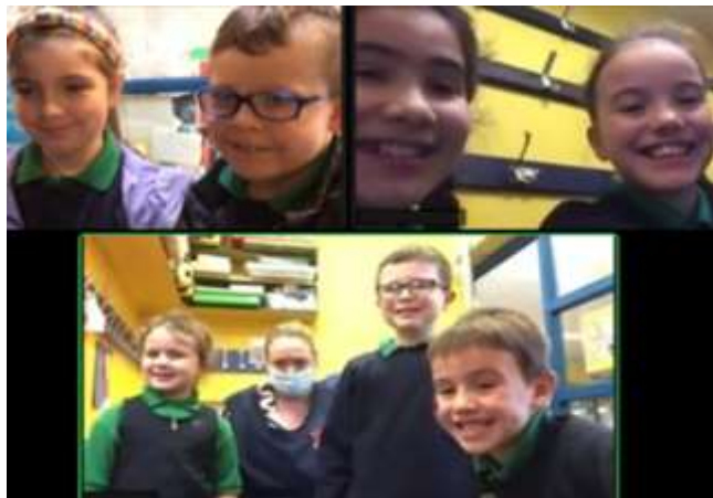
School Council Remote Meeting