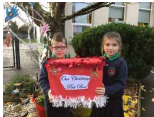
Christmas Card Collection